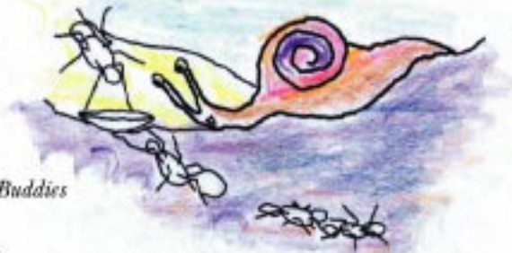
The Backyard Buddies

The ants, and the Backyard Buddies who listen to the story, learn that our size or shape or status does not prevent us from making a difference wherever we are.